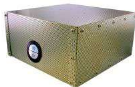
Free Standing Desiccators