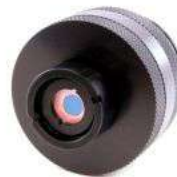
High Voltage Motor Protection Unit