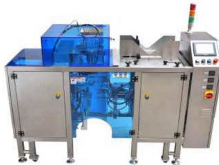
Linear Compact Premade Pouch Machine