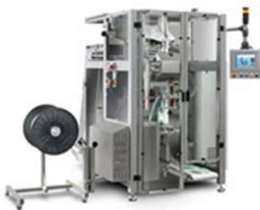
Doy-Pack Packing Machine