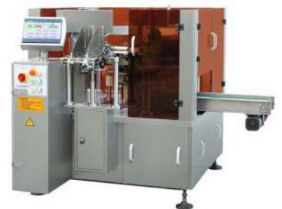
Rotary Compact Premade Pouch Machine