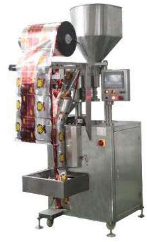
VFH6-G420 Pillow Bag VFFS Bagger (PLC)