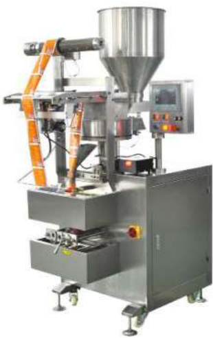
VFH6-4S-G320 4 Side Seal VFFS Bagger (PLC)