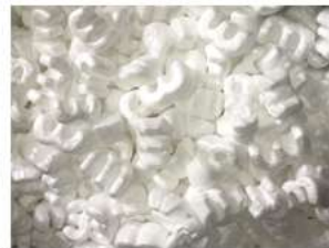
Polychip Foam (Peanuts)