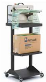
AirPouch Express 3 Void-fill System