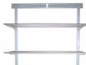
Wall Shelving 24" x 48"