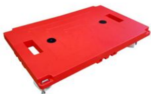
Jumbo - Mule Dolly