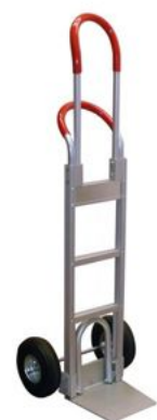
Mule Hand Truck