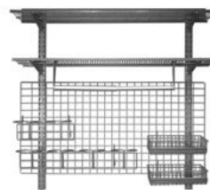
Wall Shelving Sink Kit