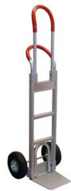
Mule Hand Truck