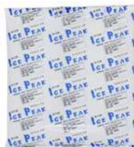
Ice Peak Ice Gel Pack