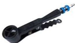
Standard Inflation Tool